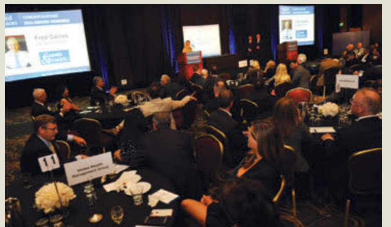
Nearly 300 attendees were on hand for the San Fernando Valley Business Journal's Trusted Advisors Awards reception at the Hilton Los Angeles/Universal City hotel.